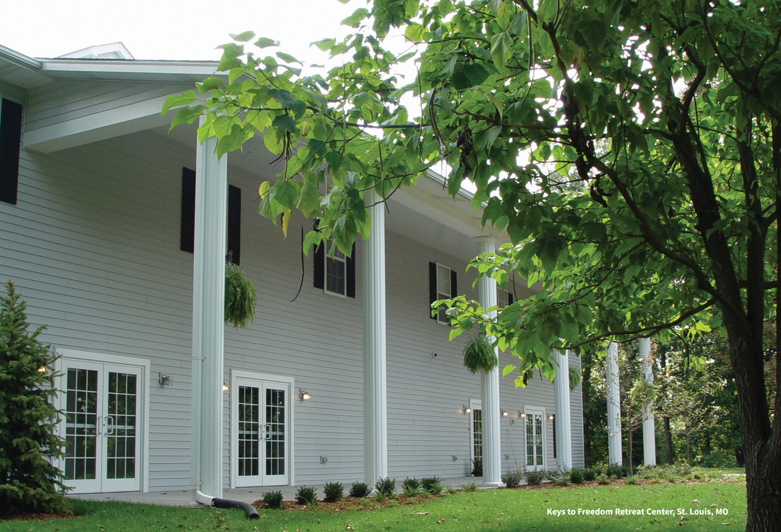
Keys to Freedom Retreat Center, St. Louis, MO