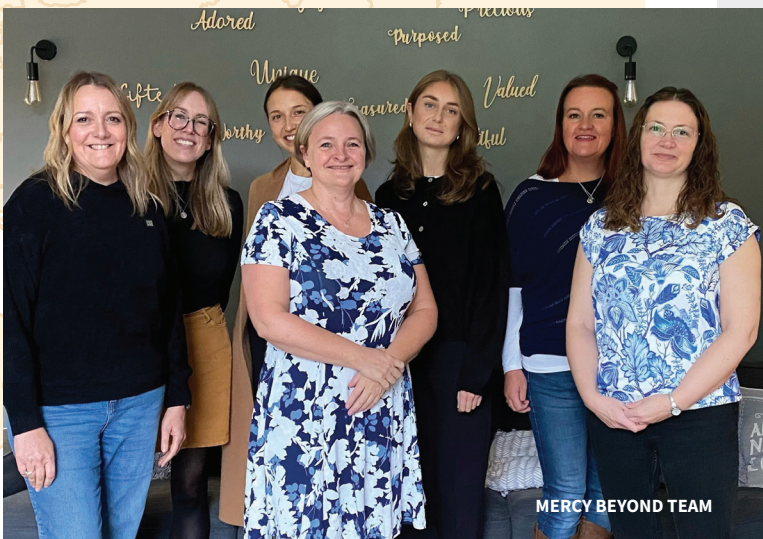
MERCY BEYOND TEAM

For more stories of transformation scan the QR Code with the camera on your phone.